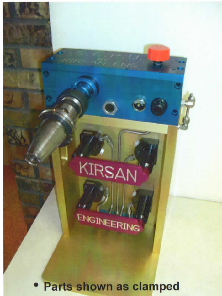
• Parts shown as clamped